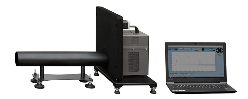
Fig. 1. Photo of the SAFT measuring set