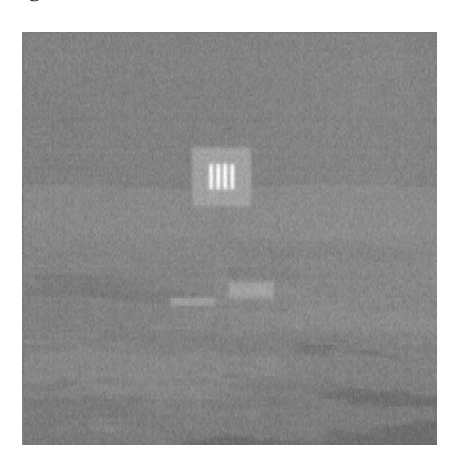
Fig. 3. Image of the LAFT set generated by the tested imager during MRTD measurements