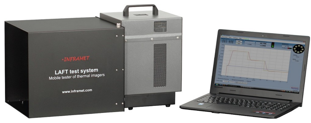
Fig. 1. Photo of the LAFT measuring set