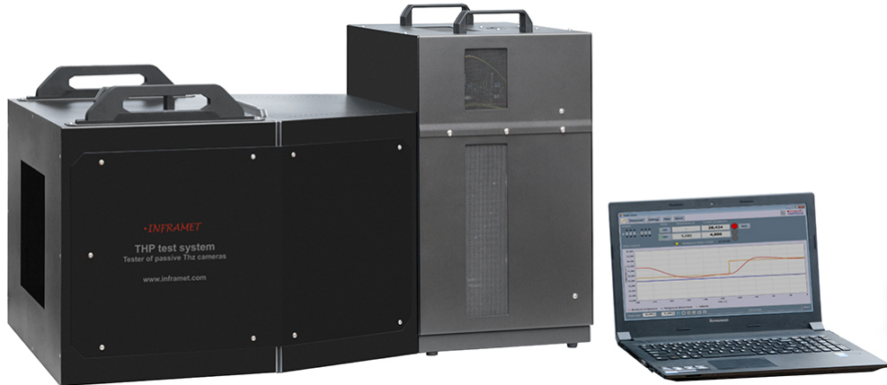
Fig. 1. Photo of the THP-8D-A-ST test system