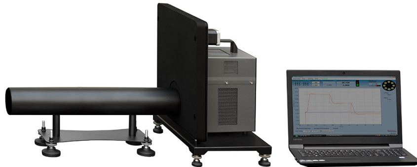
Fig. 1. Photo of the SAFT measuring set