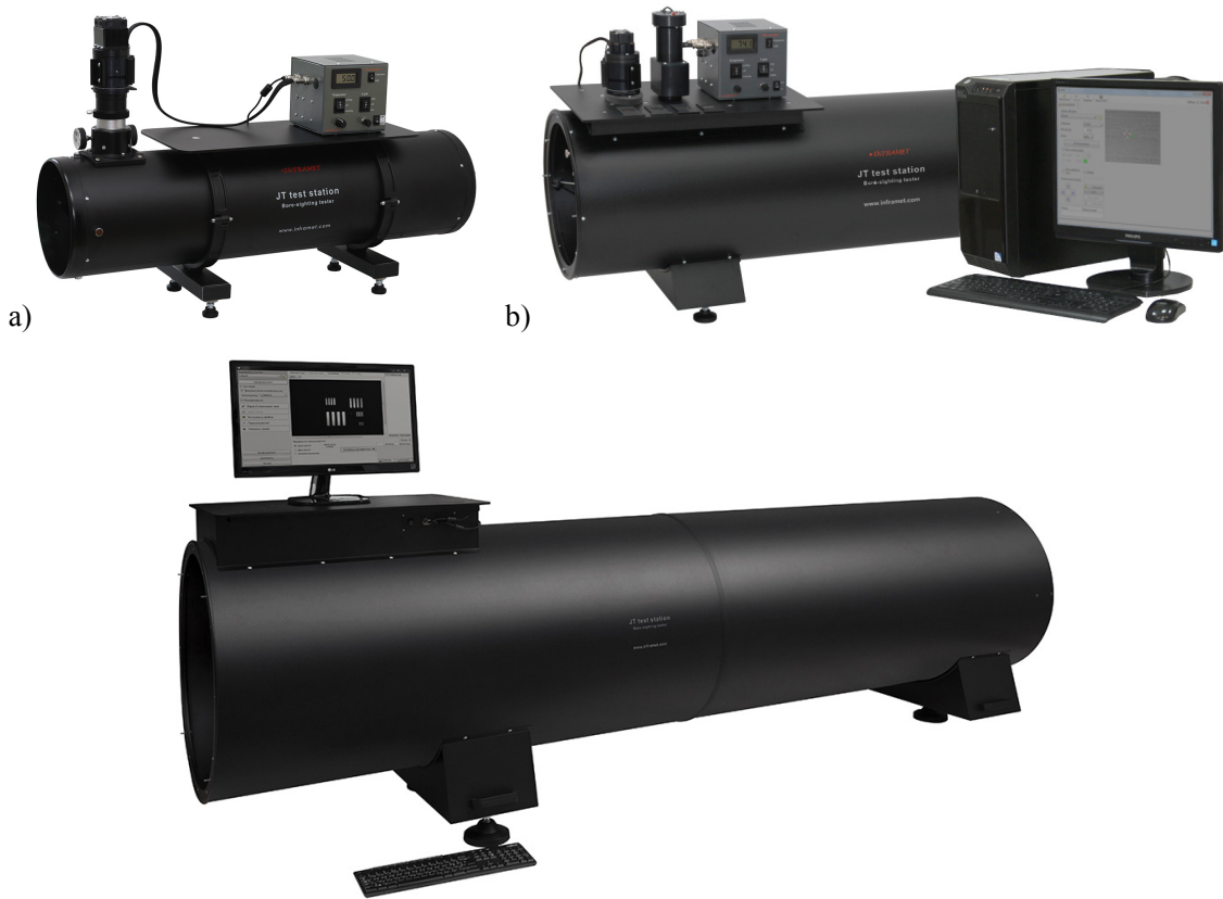
Fig. 1. Photo of the JT boresight stations a)JT200, b)JT300, c)JT600