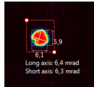
Fig. 3. Spatial intensity profile of laser beam at optical infinity