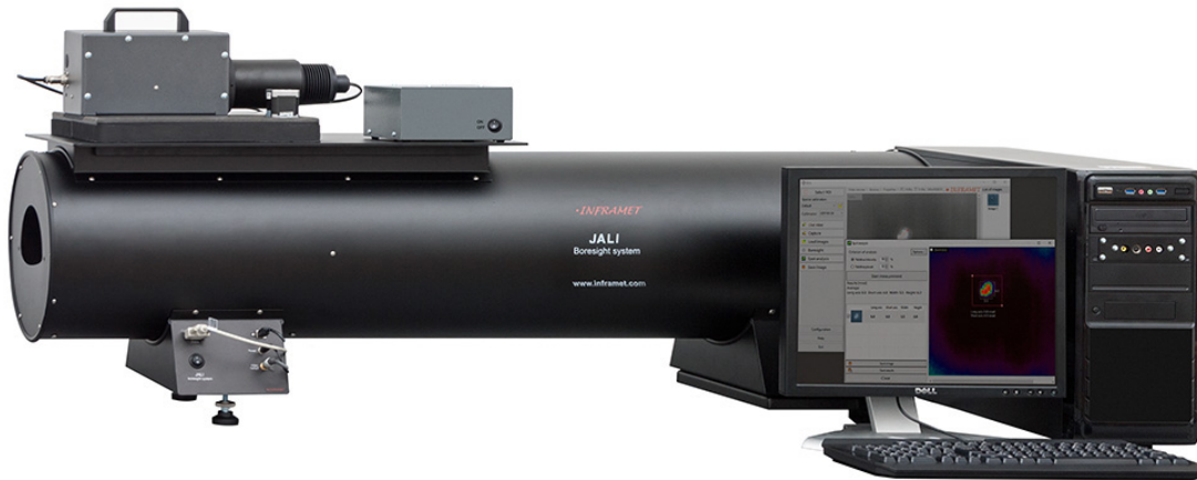
Fig. 1. Photo of the JALI boresight system