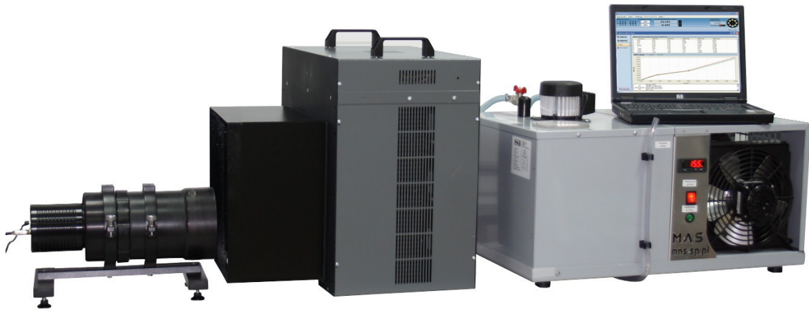
Fig.1. Photo of BLIQ-12D blackbody